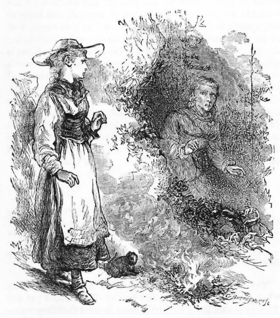
MAY NOT THAT LIGHT BETRAY?

It is nearly two hundred years since the long persecutions of the church in the Alpine valleys ended in their "Glorious Return" from exile, and their gain of liberty of conscience and freedom from the yoke of Rome. It is but right that in 1889 Protestant countries should unite in offering sympathy and brotherly help to the Waldensian Church in its time of commemoration. Two hundred years ago, Britain, Germany, Holland, Switzerland, and the Protestants of France vied with each other in showing their generous love for these sorely-tried children of God. And in these happier times it is well to turn back the history page to learn what it was that stirred the hearts of our torefathers; to learn what manner of woe it was that the Vaudois endured; to read how the God they served did not suffer them to be tempted beyond what they were able to bear, butgiving them the high honour of bearing witness to His truth, He comforted them at last with His gifts of freedom and of peace. It is in such memories that nations may learn their lessons of truest wisdom. Christianity should be national as well as individual: the Heavenly King demands service from nations as well as from hearts. And it is right that though the Waldenses are foreigners, and a people of but small account on Europe's muster-roll, their bi-centenary, soon to be celebrated, should waken echoes in England; such echoes as God wills that noble deeds should stir throughout all time.