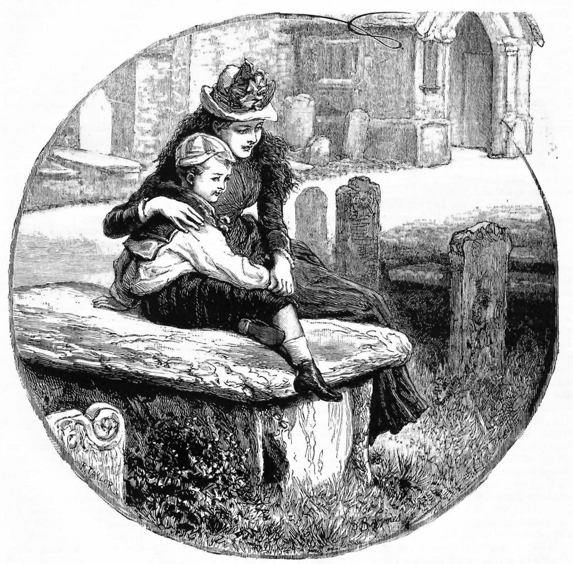
ALICE WANTS CHARLIE TO BE GOOD THAT SHE MAY LISTEN TO THE PEOPLE SINGING.