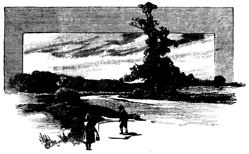
CHAPTER I .- LONELY PAUL.