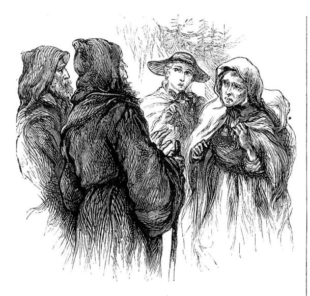
MADELEINE AND RÉNÉE STOPPED.

THEY set out, their bundles on their shoulders, walking openly in the daylight without attempt at disguise; seeking it is true the less frequented paths, and avoiding observation as much as was possible. They were so inoffensive, so insignificant, this woman and her fosterchild; surely few would notice them or hinder them—now that the bitterness of the persecution had died down.