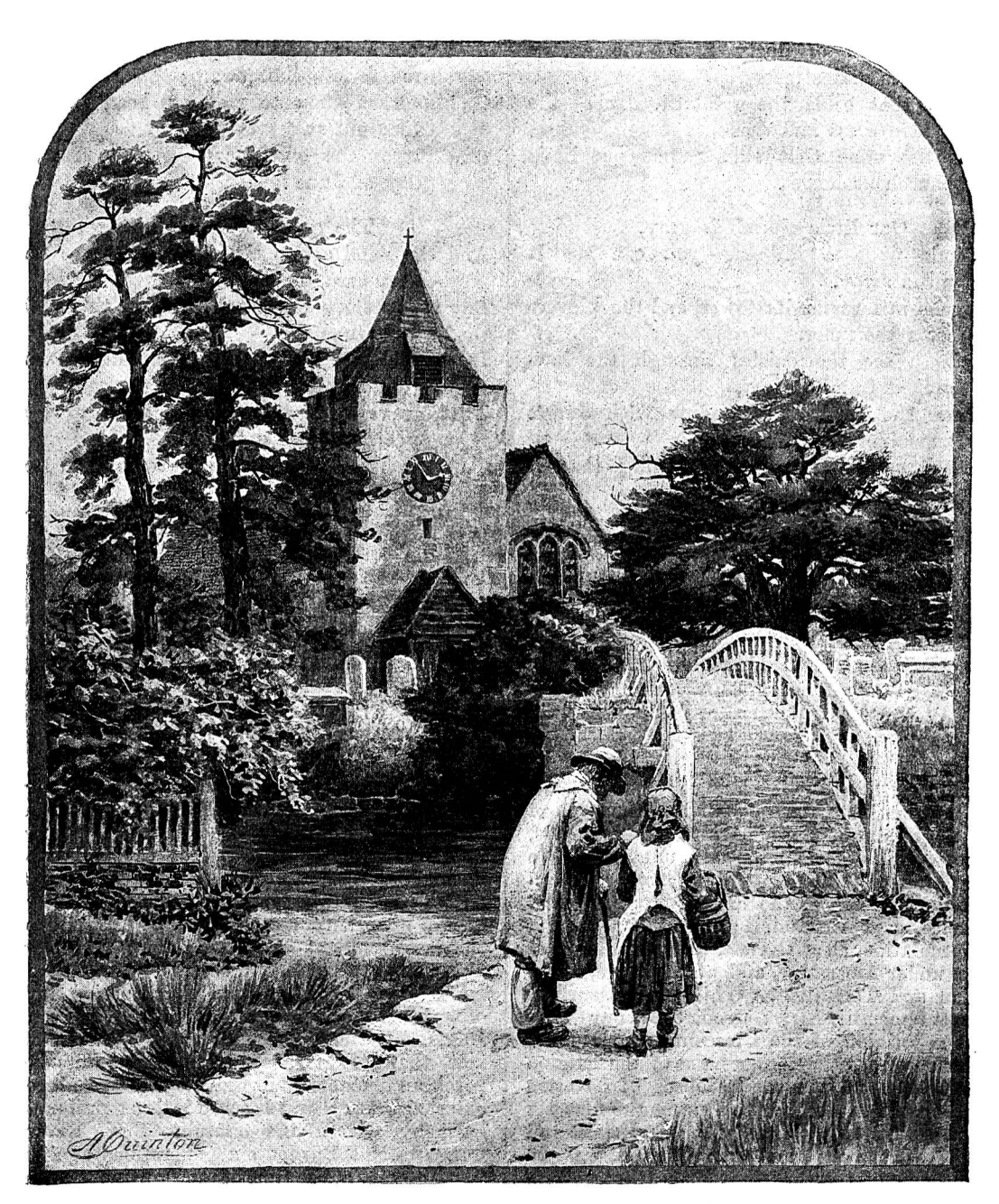
A CHURCHYARD WHERE THE DAISIES GROW.

O day most calm, most bright! . . . The week were dark but for thy light.—Herbert.