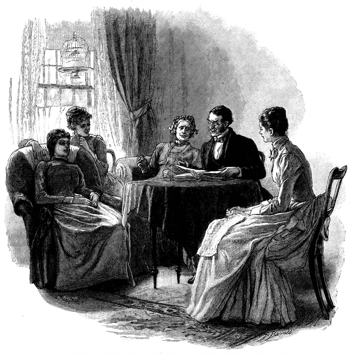
HE TURNED THE PAGES WITH A CERTAINTY THAT BESPOKE FAMILIAR ACQUAINTANCE.

CHAPTER XIII .- "UNTO THE LEAST OF THESE MY BRETHREN."