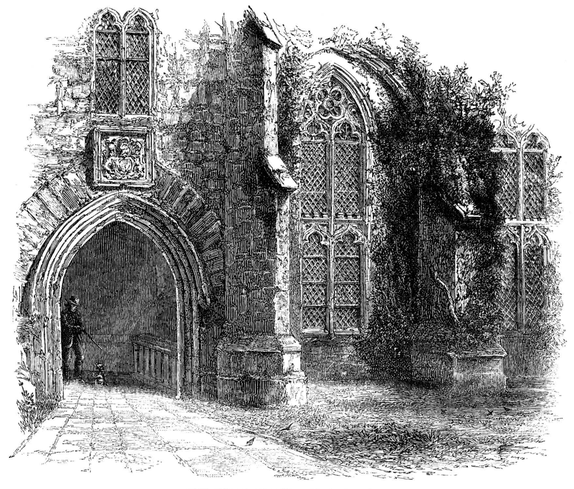
ENTRANCE TO PENSHURST BARONIAL HALL.

For many incidents in this period, as indeed for a knowledge of most of his personal history, we are